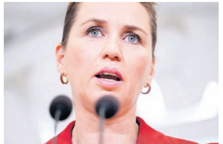
Acting Danish Prime Minister Mette Frederiksen presents the new Danish government at Marienborg Castle, in Kongens Lyngby, Denmark, Wednesday, Dec. 14, 2022.

she wanted to aim for a center-right government after the vote. □